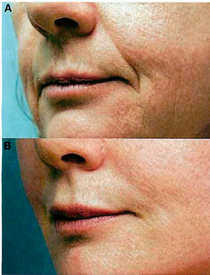
Figure 3. A: Preoperative photograph. B: One year after autologous fat grafting with PRP to nasolabial folds and lips.

breast fullness, she is receiving more fat graft for slightly larger breast at a second stage. Mammographies preoperatively, at 6 months, and then annually have revealed no abnormalities or cystic calcifications.