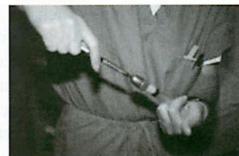
Figure 2. Addition of PRP Isolate to Graft Material.

Figure 7 shows a woman 2 years after autologous fat grafting to the breast. The patient displays a continued fullness. Although there was much improvement in