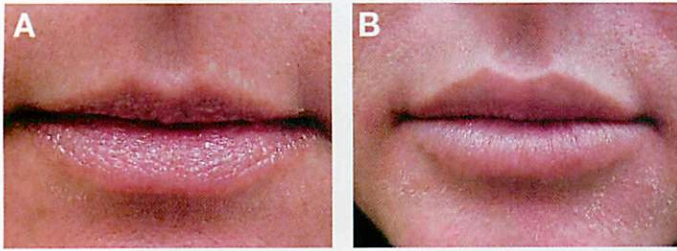
Figure 6. A: preoperative photograph. B: Patient at six months after autologous fat grafting with PRP to lips.

unresponsive wounds displayed re-epithelialization. Ganio et al 15 displayed a 78% limb salvage rate among a series of 171 patients with a total of 355 wounds of average 75 weeks' duration after daily treatment with a platelet-derived wound-healing factor concentrate for an average of 10 weeks. In the field of oromaxillofacial surgery, Marx et al. reported enhancement of bone formation on bone biopsy specimens in mandibular bone grafts after treatment with PRP. 17 Relevant to facial plastic surgery, Powell et al reported trends that may suggest enhancement of recovery with decreases in postoperative edema and ecchymoses in a pilot, randomized, prospective, controlled clinical trial involving 8 female patients treated with autologous