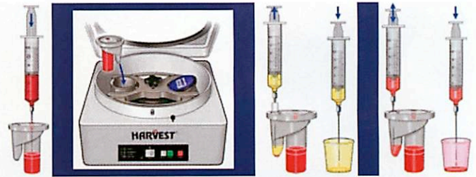
Figure 1. Isolation of PRP. Stage 1-Transferring whole blood into blood chamber. Stage 2-Load SmartPREP.® Stage 3-After processing, Platelet Poor Plasma (PPP) is isolate (Yellow). State 4-Then Platelet Rich Plasma (PRP) is isolated (red). Closed Syringe Harvest of Autologous Fat.

Figure 3 displays a female patient 1 year after autologous fat grafting with PRP to the nasolabial folds