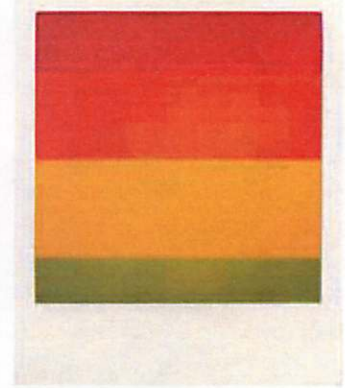
ROY G + : SA70 F100 +