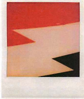
The Flash + ©2008/Seattle, WA: SA70 F100 +