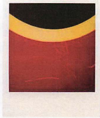
Smile + ©2008/Seattle, WA: SA70 F100 +